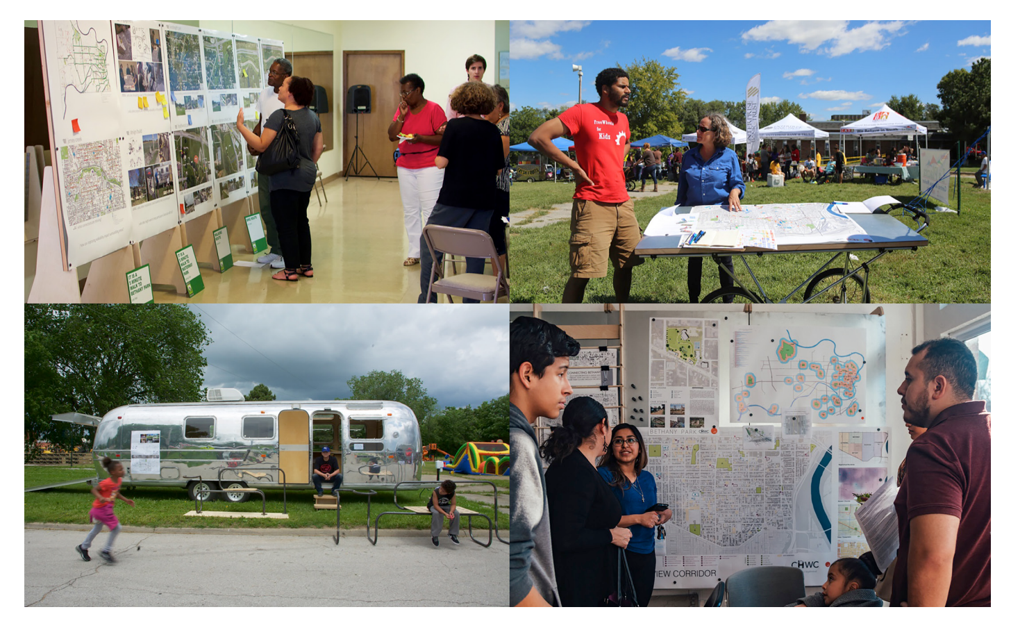
Figure 4: Engagement tools: (clockwise from upper left) pop-up panels, mapcart, Dotte Agency storefront, moCOLAB. Credit: Matt Kleinmann, Shannon Criss

Figure 3 Through direct participation we are able to transform disparate thoughts on multiple maps, to a concept sketch, to a finished strategy of a "Healthy Community Corridor that encompasses close to 50% of the county's population, contains approximatley 20 parks, and includes the districts of 5 county commissioners. Credit: (from left) Matt Kleinmann, Shannon Criss, Matt Kleinmann