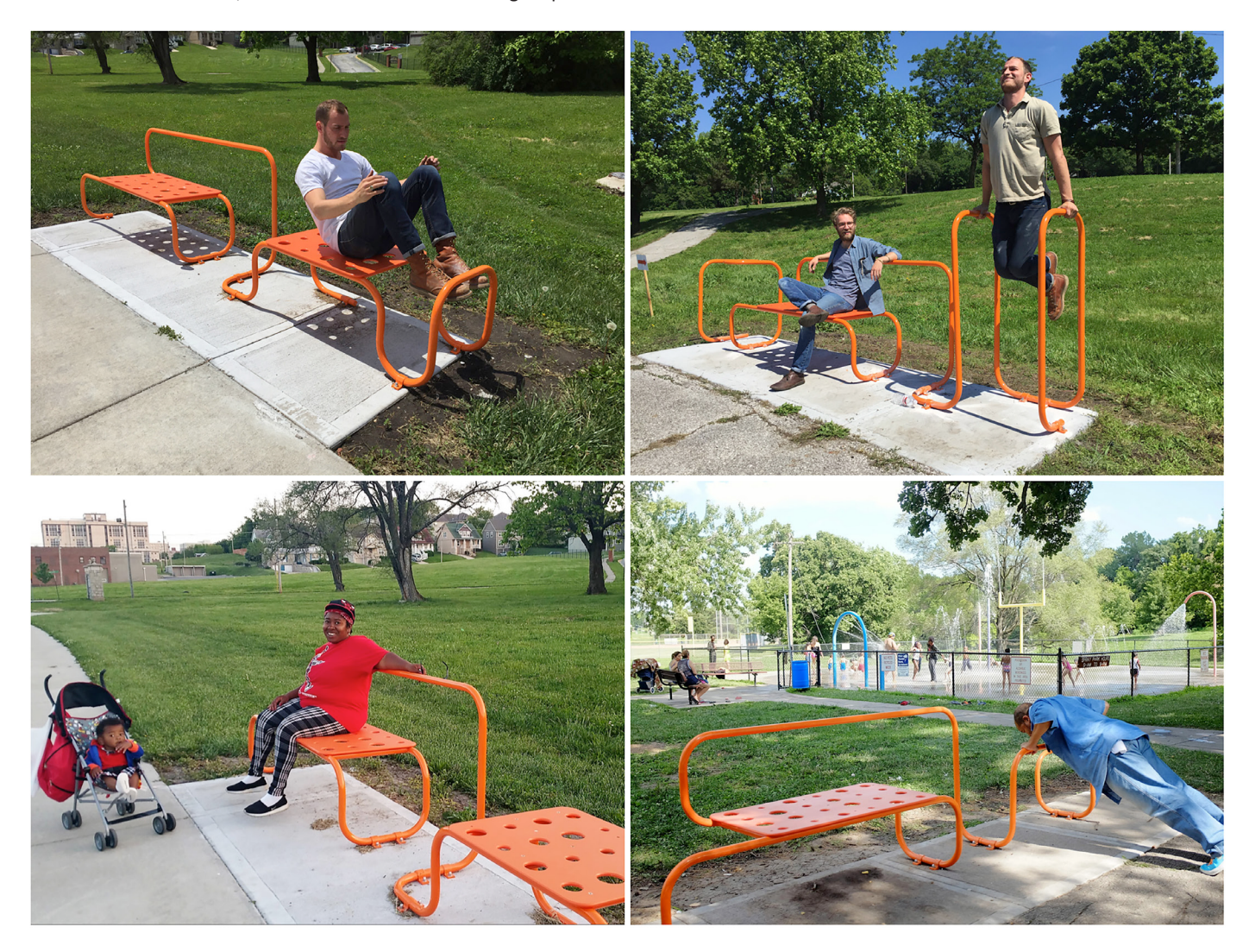
Figure 5: Fitness Station prototypes in Jersey Creek Park. Each unit contains a bench, a bike rack and an exercise element. Five prototypes were installed in May 2016.

process or state of affairs.... Action depends on the capability of the individual to "make a difference" to a pre-existing state of affairs of course of events."14 A generation (or more) ago we were trained to believe that the architect should be the sole decision-makerthe very concept of professionalism in our culture is rooted in that notion.<sup>15</sup> "A better definition [of 'agent'] in relation to spatial agency is that the agent is one who effects change through the empowerment of others. Empowerment here stands for allowing others to 'take control' over their environment, for something that is participative without being opportunistic, for something that is pro-active instead of re-active."<sup>16</sup> With these experiences it is our hope that the next generation of architects might be able to imagine a different way of being an architect-one that is more responsive to the idea of reciprocal engagement and thus, less inclined to suffer from myopic thinking about the need for a more generous and responsive design approach to pressing urban problems. Time will tell if that's the case.